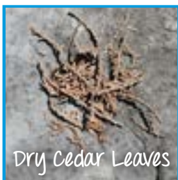
Dry Cedar Leaves